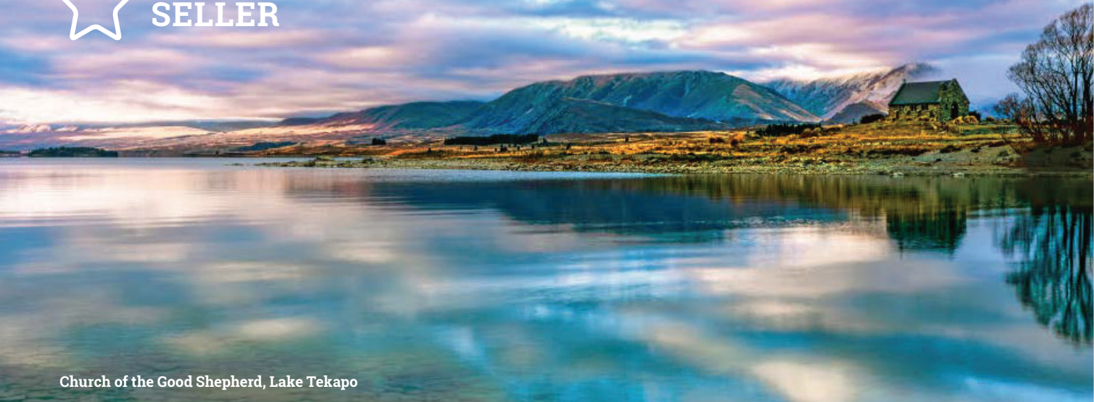
Church of the Good Shepherd, Lake Tekapo