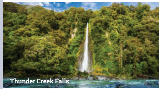
Thunder Creek Falls