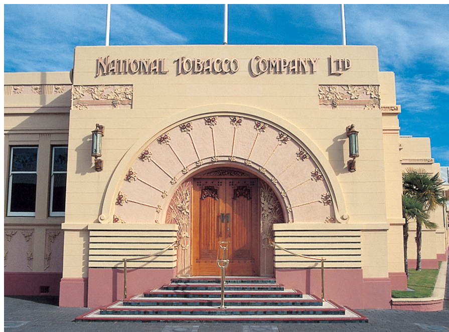
Enjoy an overnight stop in Napier, known as 'The Art Deco Capital'.